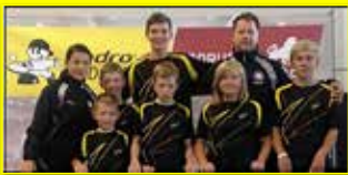
TTTA YOUNG CHAMPIONS