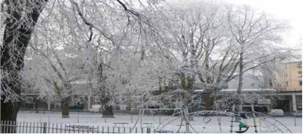
Hoar-frost December 2010

The Park was created in the late 1920s on what had been little more than a public tip. The bowling green opened in May 1928. In 1944, prior to D-Day, a US Army field-kitchen was set up in the park to serve meals to troops before they marched down to Torquay Harbour to embark onto the ships that would take them over to the beaches of Normandy.