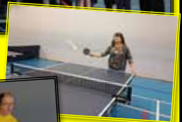
TTTA SOCIAL GROUP